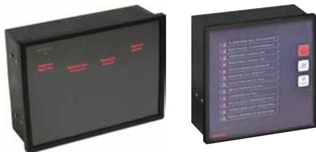
Compact alarm or safety system